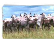
Nellore cows with 1/2 Braunvieh – Nellore calves